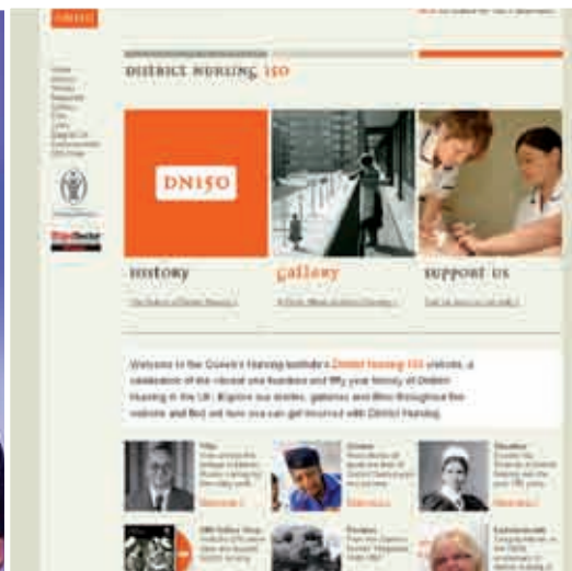
The award winning website

We were delighted to win an award for our commemorative website celebrating 150 years of district nursing at the Third Sector Excellence Awards.