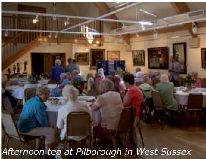
Afternoon tea at Pilborough in West Sussex

We were invited to join events involving retired Queen's and district nurses commemorating the anniversary.