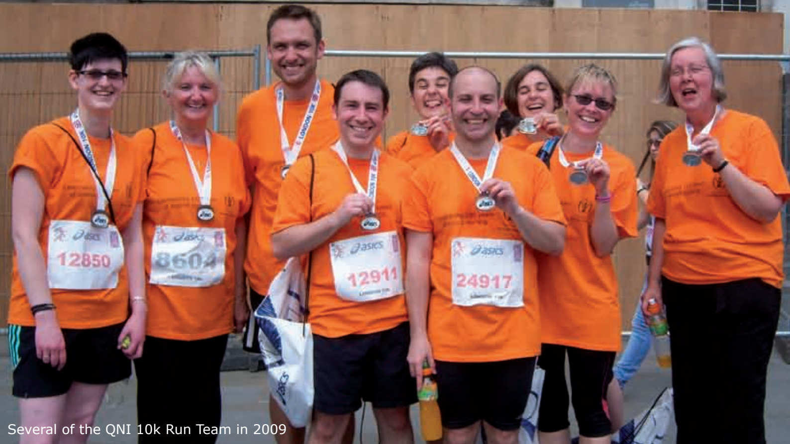
Several of the QNI 10k Run Team in 2009

Every year, millions of people of all ages need professional nursing care at home. In fact, nine out of ten contacts between health professionals and patients occur in community settings.