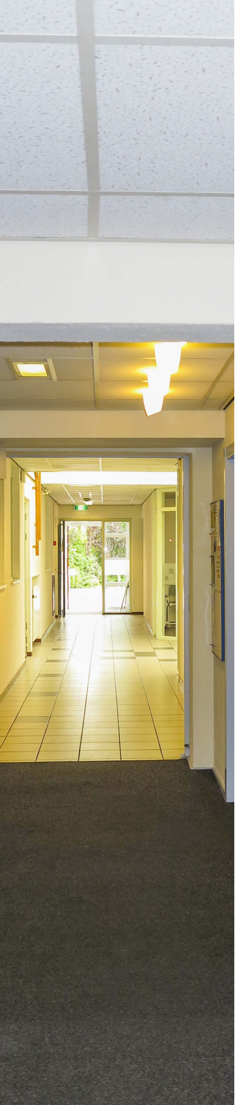
Figure 4.2 – Health conditions you may see in a care home with nursing