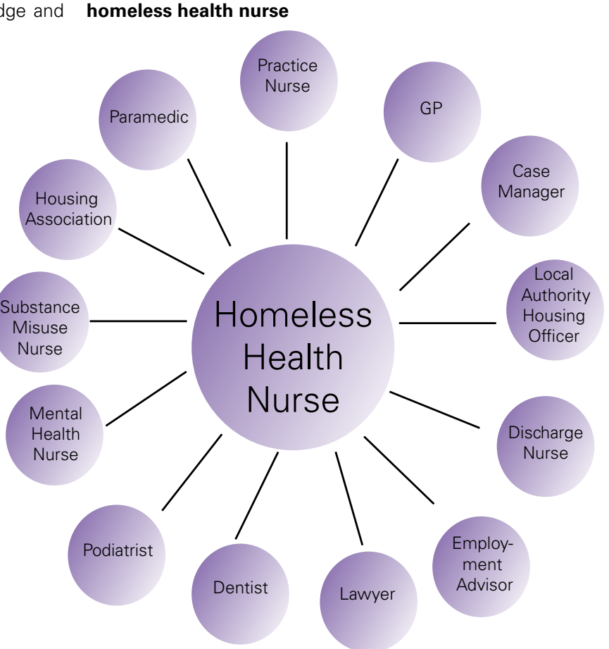
Figure 1.4 – Some key professional links for the

Your patients are entitled to access the wide range of professionals for their health and overall social care, just the same as anyone else in our society. It is essential therefore that you understand these different roles. You are likely to have a key co-ordinating role; ensuring care is well managed for your patients. This can include though is not limited to, the range of professionals in figure 1.4.