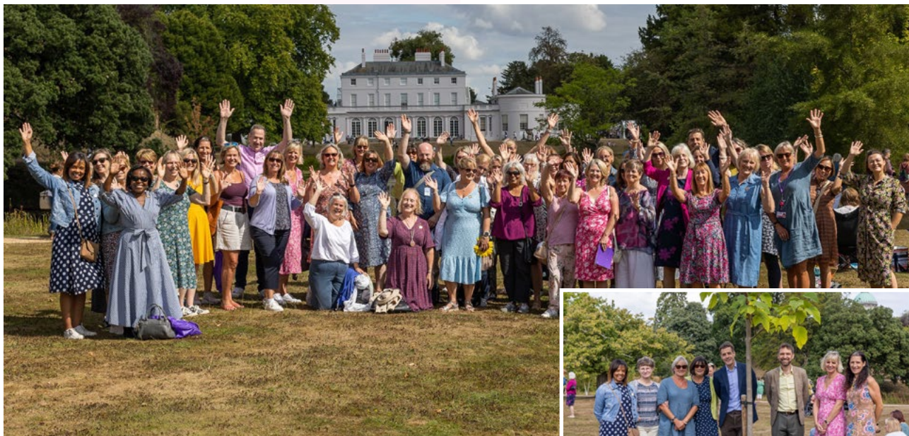
Above: Over 50 Queen's Nurses (new and retired) attended the opening of Frogmore Gardens for the National Garden Scheme. Right: QNI staff around the Foxglove tree gifted to HM The Queen and planted at Frogmore to commemorate the International Year of the Nurse and Midwife in 2020.

Queen's Nurses continue to visit open gardens during the year, they are encouraged to take selfies of themselves and tag the QNI and the NGS.